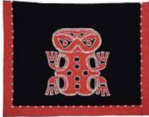
Button Blanket with Frog $1,250 at Bonhams in San Francisco

In Bonham's sale in San Francisco on September 12 2011, Mask by Alaskan artist Lelooska Don Smith (1933-1996) sold for $938. A Killer Whale headdress with articulations, 21" long, sold for $1,875. A button blanket depicting a frog sold for $1,250. Baskets, including a number from the Northwest, sold well.