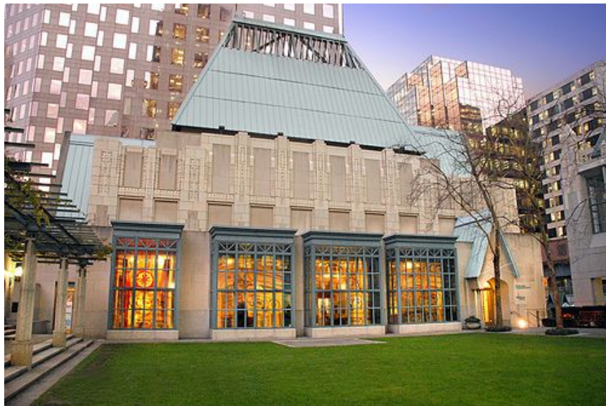
The Bill Reid Gallery of Northwest Coast Art 169 Hornby Street in Vancouver

For more about the Davidson exhibition visit http://westerngallery.wwu.edu