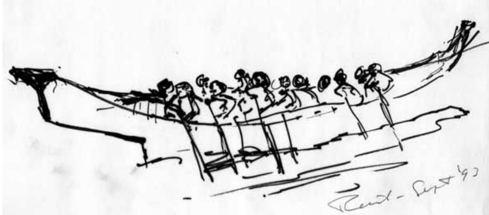
Bill Reid, Lootas (Wave Eater) , 1993 Ink Drawing by Bill Reid Collection of the Bill Reid Foundation