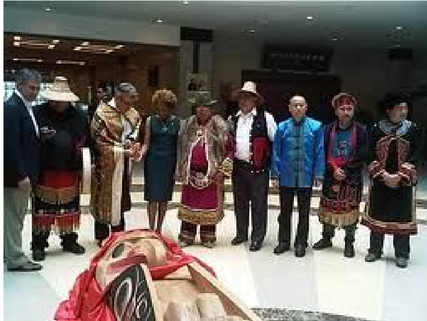
Totem Pole Ceremony in Chengdu, China in 2010

The pole that was carved by the Freda Diesing School to commemorate the victims of the 2008 earthquake in China's Sichuan province will be raised in China in October 2011.