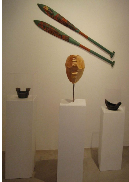
Sonny Assu at West Vancouver Museum until November 5 2011

this gallery, they may contact for more information, contact art_rental@ago.net