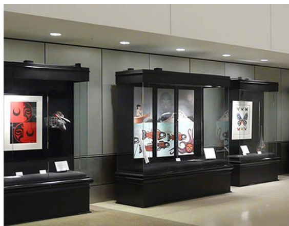
Stonington gallery display at SeaTac Airport, Seattle

Work by Vancouver artist Dana Claxton is included in the exhibition Steeling the Gaze at the McMichael Collection of Canadian Art near Toronto, to September 11 2011. The exhibition originated with the Canadian Museum of Photography at the National Gallery of Canada; a thoughtful review of the exhibition as a whole can be found at: http://www.cielvariable.ca/archives/en/component/content/article/124-5-chronique-regards-dacier-portraits-par-des-artistes-autochtones.html