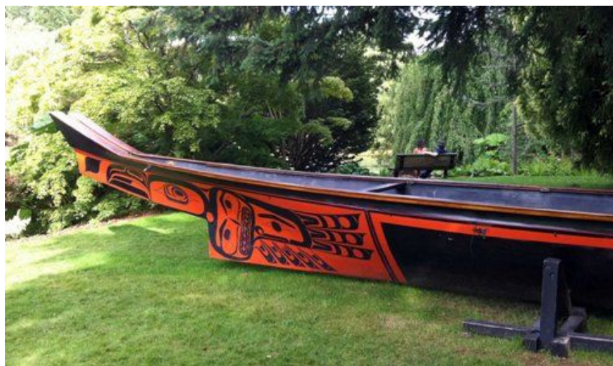
Replica of Lootaas , Bill Reid's Haida canoe at Vancouver's Vandenusen Gardens

This is the forty-fifth issue of The Beat, a free, independent newsletter that brings you up-to-date on the art, artists and events of the First Nations on Canada's Pacific Coast.